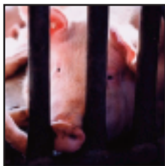
They're not so different.

Please encourage your local shelter or rescue group to take the Merciful Menu pledge, to help widen the circle of compassion and respect the lives of all animals.